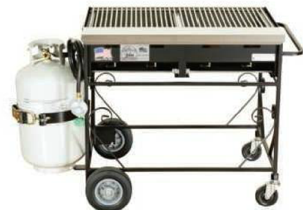
A2CC with Stainless Steel Grates Shown with Optional LP Holder & 30 lb. Tank