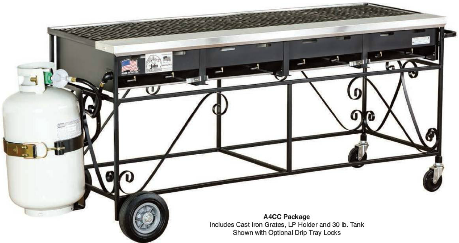
A4CC Package Includes Cast Iron Grates, LP Holder and 30 lb. Tank Shown with Optional Drip Tray Locks