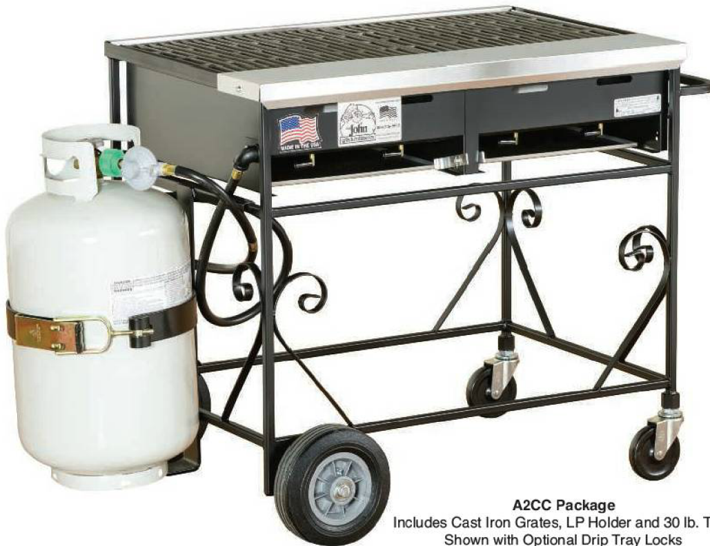
A2CC Package Includes Cast Iron Grates, LP Holder and 30 lb. Tank Shown with Optional Drip Tray Locks