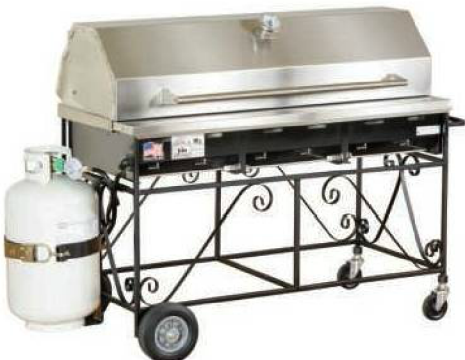
A3CC Package and Hood Hood Open and Closed