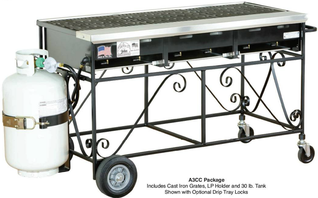
A3CC Package Includes Cast Iron Grates, LP Holder and 30 lb. Tank Shown with Optional Drip Tray Locks