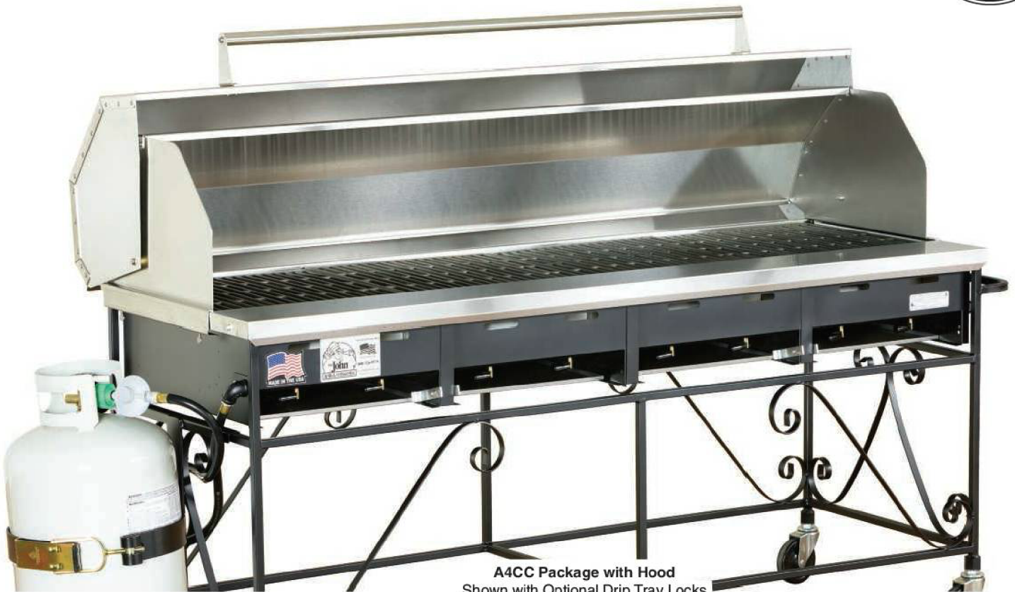
A4CC Package with Hood Shown with Optional Drip Tray Locks