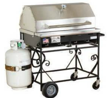
A2CC Package and Hood Hood Open and Closed