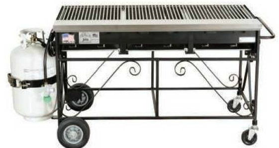
A3CC with Stainless Steel Grates Shown with Optional LP Holder & 30 lb. Tank